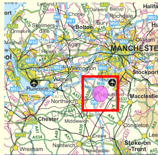
0 72km Image produced from the Ordnance Survey Get-a-map service. Image reproduced with kind permission of Ordnance Survey and Ordnance Survey of Northern Ireland.