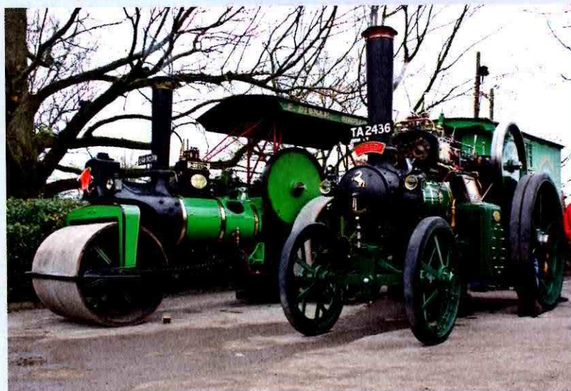
BELOW - Aveling & Porter tractor No. 7838, Fred , stands side-by-side with Aveling roller No. 7632, Betsy .